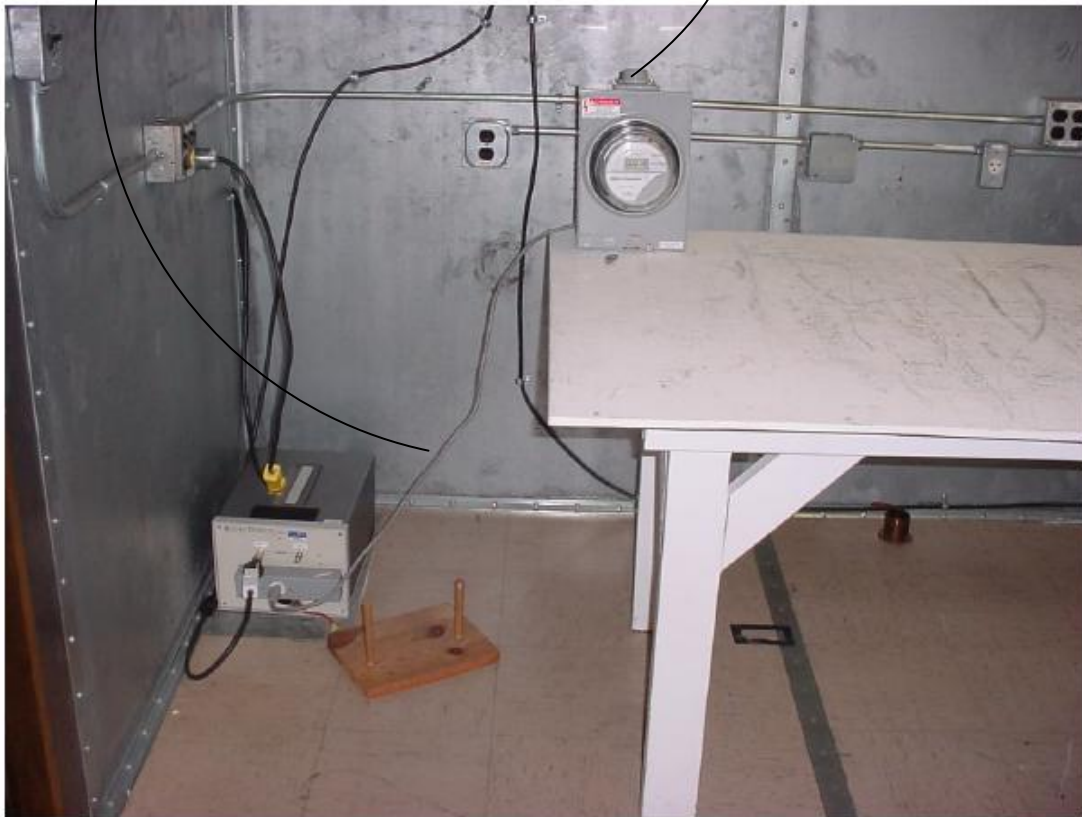
Figure 3: Conducted Emissions – Front View

No House Mains wiring installed for simulation (on radiated and conducted emissions tests).