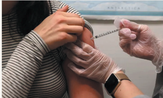
▲ A woman receives a flu vaccine in San Francisco in 2018.

Anti-vaxxers keep telling the same obvious lies without shame, despite being debunked and factchecked