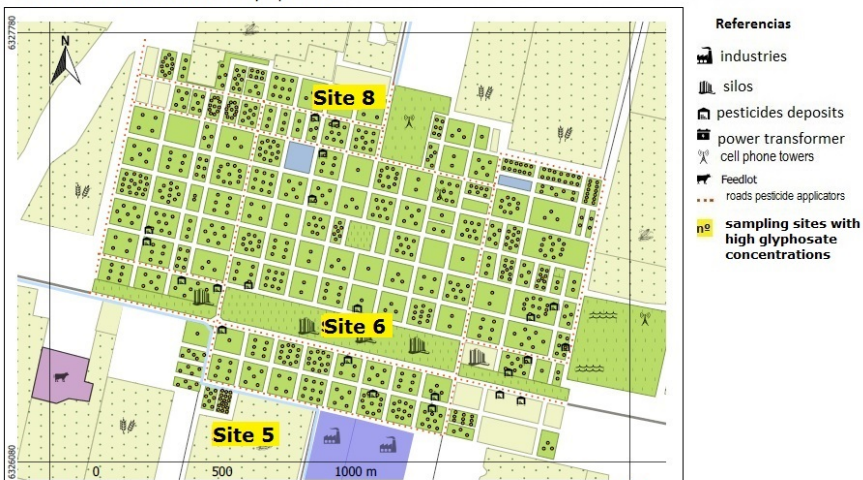
Figure 2 Map of environmental factors pollution on Monte Maíz, main sampling site and distribution of inhabitants with asthma symptoms

tabla n<sup>o</sup> 3.doc available at https://authorea.com/users/350829/articles/475560-risk-of-asthma-and-environmental-exposure-to-glyphosate-in-an-ecological-study